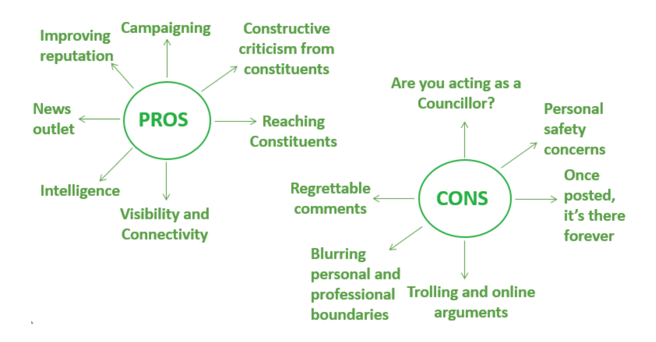
Part 6J: Social Media Policy